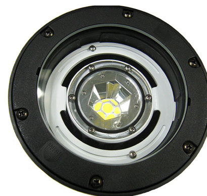
ActiveLED In-Ground RDS Retrofit

Applications include: Trails, Walkway and Pathway Lighting, Flag Poles, Building exteriors